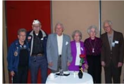
Pearl Harbor Survivors: "Our picture was in the paper again!"