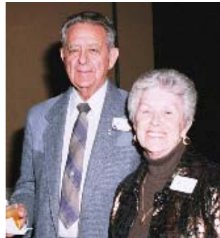
There's more to this than meets the eye. They've been up to something; Call the Sheriff!